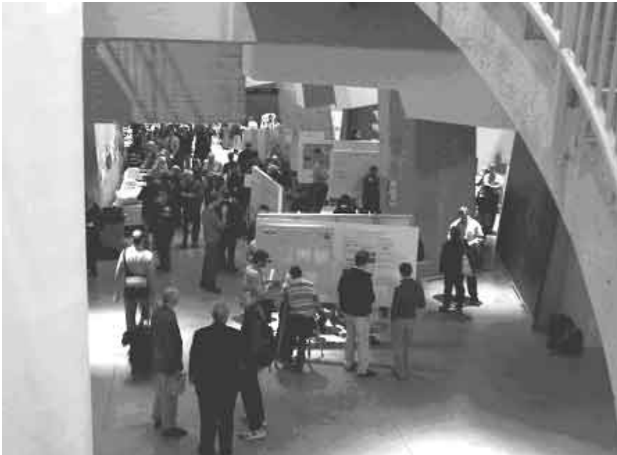
The poster session was held in the new Stata Center

With a two-ion balance, Einstein's famous equation relating mass to energy has been verified to a part in 10,000,000.