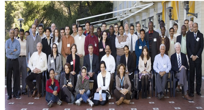
Workshop Participants at ICTP