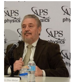
Fidel Castro Diaz-Balart