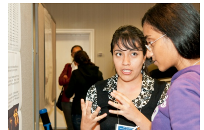
CAM Participants – Poster Session