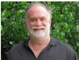
David Schimel, Ph.D. Jet Propulsion Laboratory

David DiCarlo's research is focused on applying advanced experimental techniques to understanding fluid flow in hydrocarbon reservoirs. In particular, judicious use of CT scanning provides in-situ phase saturations which can then be converted into permeabilities and relative permeabilities. These can be obtained on a much shorter time scale and over a wider range of saturations than traditional steady-state methods. Topics relevant to enhanced oil recovery such as three-phase flow (water, oil, and gas), surfactant imbibition, compositional displacements, flow stability, and the effect of nanoparticles in porous media are studied using these methods.