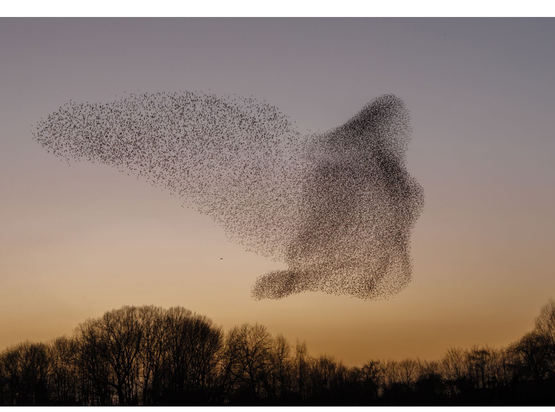
Starlings flock in a so-called murmuration, a collective behavior of interest in biological physics — one of many subfields that did not always "belong" in physics.