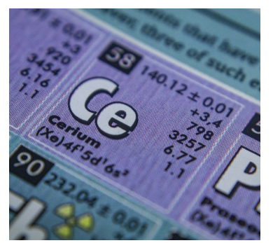
New experiments indicate that cerium-140 is significantly more likely to capture an incoming neutron than previously thought.

periodic table — the one with one additional proton.