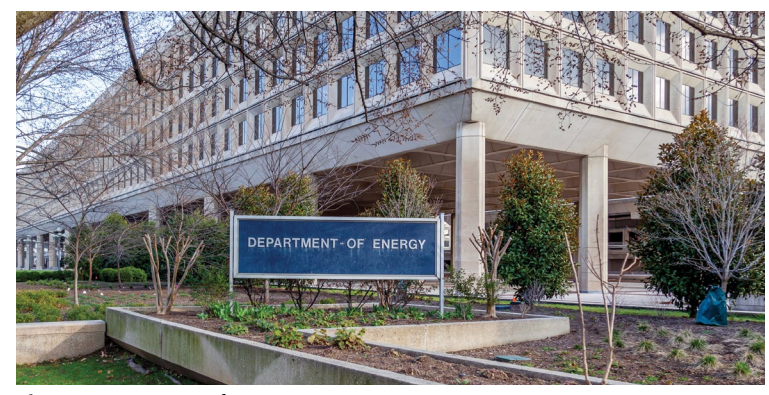
The U.S. Department of Energy.

NIST also received one of the largest cuts in percentage terms across science agencies, dropping 8% to $1.16 billion. This rolls back about half of the increase Congress provided NIST for the previous fiscal year, for which its base budget grew 18% to $1.26 billion. (These figures exclude earmarks for projects external to NIST.) The DOE's Office of Science was one of the few science agencies to escape budget cuts, receiving a 1.7% increase to $8.24 billion that builds on the 8% increase it received last fiscal year. Nevertheless, the amount for this year is unlikely to keep pace with inflation and will still present the agency with hard choices on what programs to prioritize.