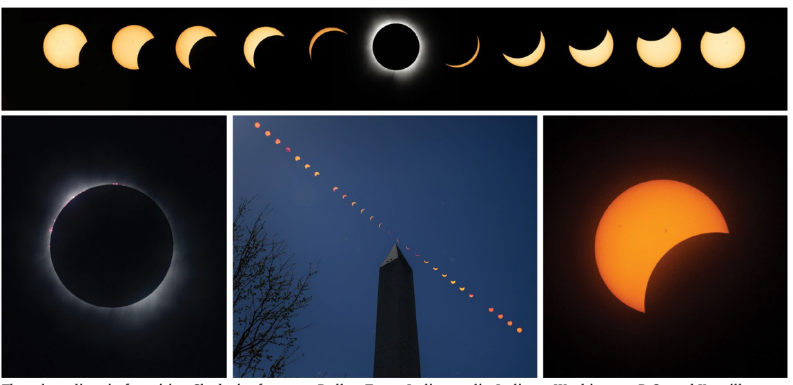
The solar eclipse in four cities. Clockwise from top: Dallas, Texas; Indianapolis, Indiana; Washington, D.C.; and Kerrville, Texas.

O n April 8, 2024, millions of people across the continent watched the sky plunge into darkness as the moon passed between the sun and Earth. This was the first