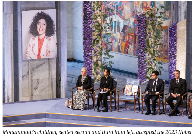
Peace Prize on her behalf in Oslo last fall. Mohammadi's portrait hangs on the wall.

Iranian Revolution, while Mohammadi was a child, the newly formed Islamic republic imprisoned, tortured, and executed members of her extended family. "My childhood dreams were cruelly shattered," she wrote in a message to the Norwegian Nobel Committee in October 2023