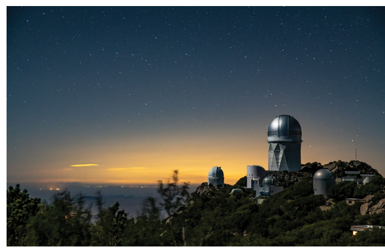
DESI is housed at Kitt Peak National Observatory in Arizona.

far that those ideas may be on the right track. The reported discrepancy with \Lambda CDM lacks the statistical significance to claim a discovery, so the DESI collaboration remains cautious about its importance until they have more data. But other experts are expecting theorists to immediately begin proposing revisions of \Lambda CDM .