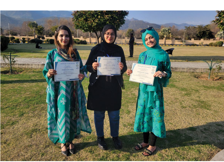
Attendees of the March Meeting satellite site in Islamabad, Pakistan, show off attendance certificates.